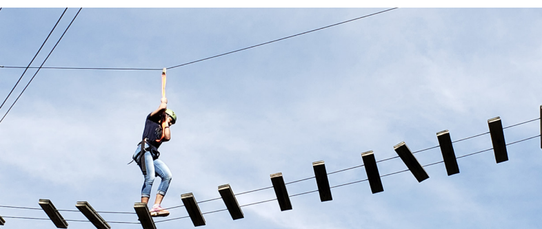
High challenge course