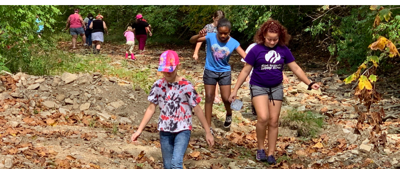
Trekking | Hiking