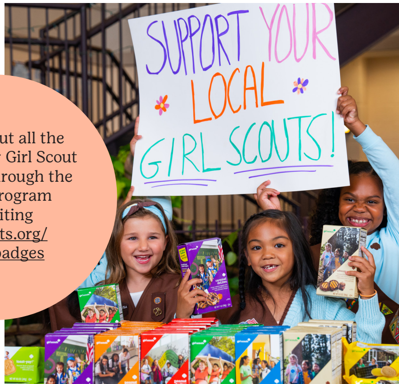
Entrepreneur Pins and Badges

Learn about all the badges your Girl Scout can earn through the cookie program by visiting girlscouts.org/cookiebadges