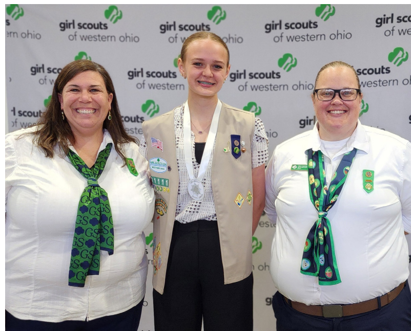
Girl Scout Gold Award