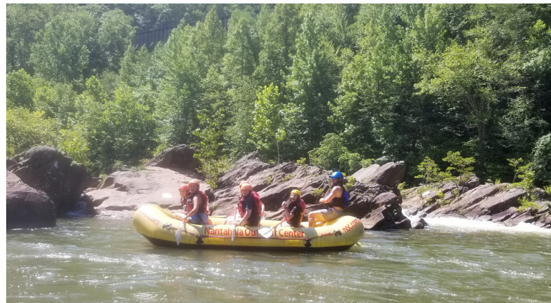
White water rafting