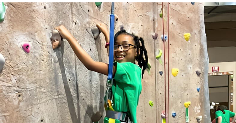
Rock climbing wall